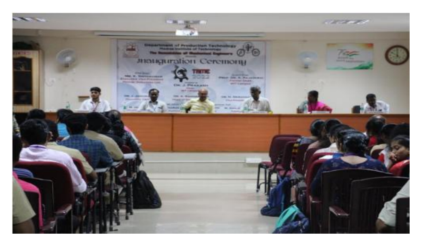
TAME Association (The Department of Mechanical Engineers) –Pistobolts 01/04/2023